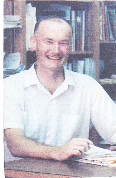
A more recent photo